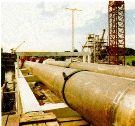
Figure 2 - 711 mm O/D CuNi10Fe1Mn pipework in Frigg. TCP2 compression module at Grinstad Norway.

The material that appears most nearly to meet the broad requirements of a wide range of seawater pipeline applications is 90/10 copper-nickel (Figure 2). It has a long history of satisfactory use as material for both heat exchangers and pipelines in marine applications (Figure 3). There is an extensive literature of published information and various comprehensive review papers are available [1, 2, 3]. One major manufacturer recorded [1] that over the first 20 years of the use of the material for seawater pipelines (during which time large quantities were supplied), only nine cases of premature failure occurred, four of which were associated with material having a lower iron content than that normally added to confer good corrosion resistance. In no case was failure due solely to excessive seawater velocity.