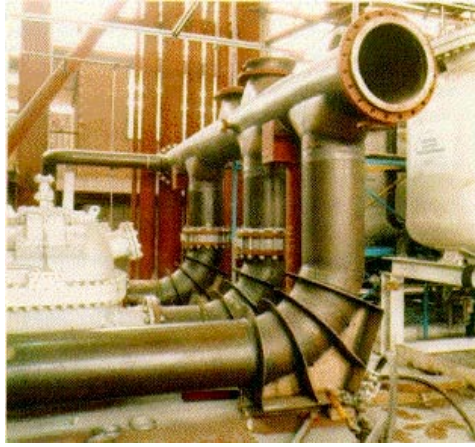
Figure 1 - Seawater pipeline systems of CuNi10Fe1Mn on the Texaco TARTAN A platform.