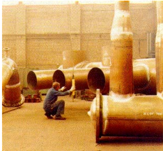
Figure 3 - Seawater pipeline systems for the YANBU seawater-desalination plant in Saudi Arabia. (photo: VDM).