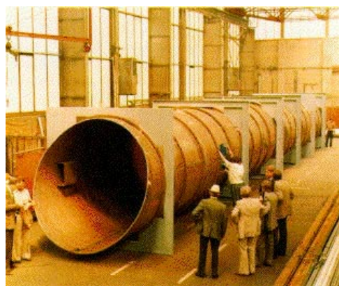
Figure 5 - Seawater suction pipe for the fire extinguishing plant at Jeddah airport in Saudi Arabia.(photo: VDM).