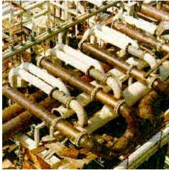
711 O/D and 508 mm O/D CuNi10Fe1Mn pipework used on saltwater cooling lines for 'TCP2' compression package - 'Frigg' Field

Of the materials considered in this paper, 90/10 copper-nickel is the one most widely used and most likely to fulfil the majority of requirements for the future.